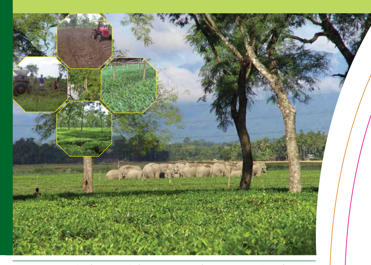
1. uprooting 2. soil prepartion 3. clone propagation in in-house vp nursery 4. Tea garden

Diana Tea Company has achieved turnover of Rs. 40.84 crores this year, while last year the turnover was Rs. 38.83 crores. So it is quite clear that the profit is increasing consequently. To utilize the profit and to become modernized as well as poised, the company is now seeking to move ahead with the diversification of business. We allocate 125 acres of land in one of our tea estate for the development of eco-based tea tourism. We have already approached West Bengal Government for the conversation about the eco-based tea tourism theory. Not only that, but we also have a plan to utilize the other vacant areas that remain in the tea estate by planting other relevant plants. To spread the business we have an idea of setting up a telecom / power transmission tower fabrication / galvanization unit in and around Kolkata.